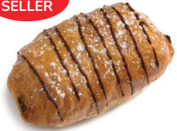
Pain Au Chocolat