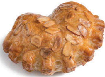
Almond Bear Claws