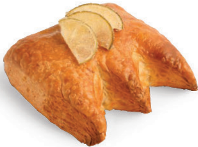
Key Lime Custard Gator Claws